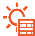
Rights of Light & Party Wall