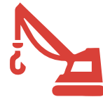
Civil & Structural Engineering