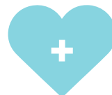
Health & Safety Risk Management